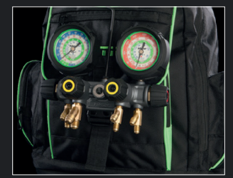
A METAL LOOP GIVES YOU AN EASY WAY TO TRANSPORT YOUR MANIFOLD